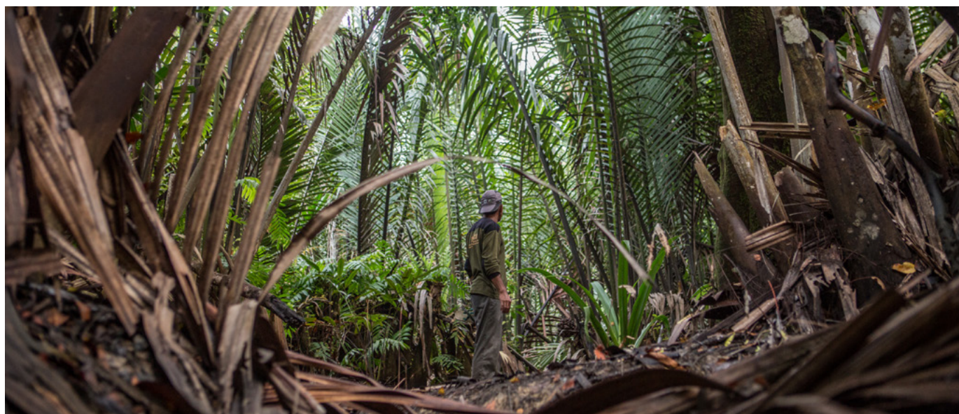
Forest patrol, Indonesia