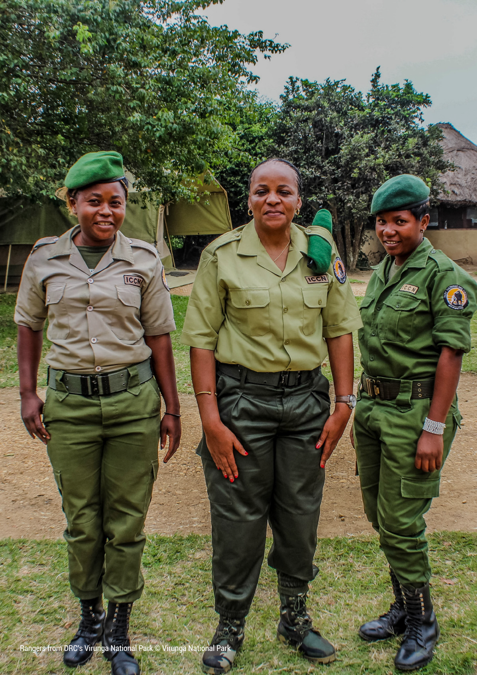
Rangers from DRC's Virunga National Park