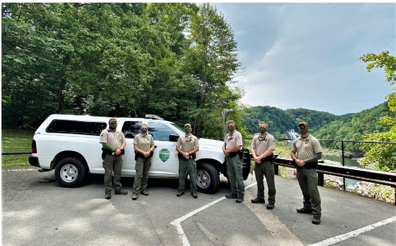
Rock Island State Park Rangers under COVID19 regulations