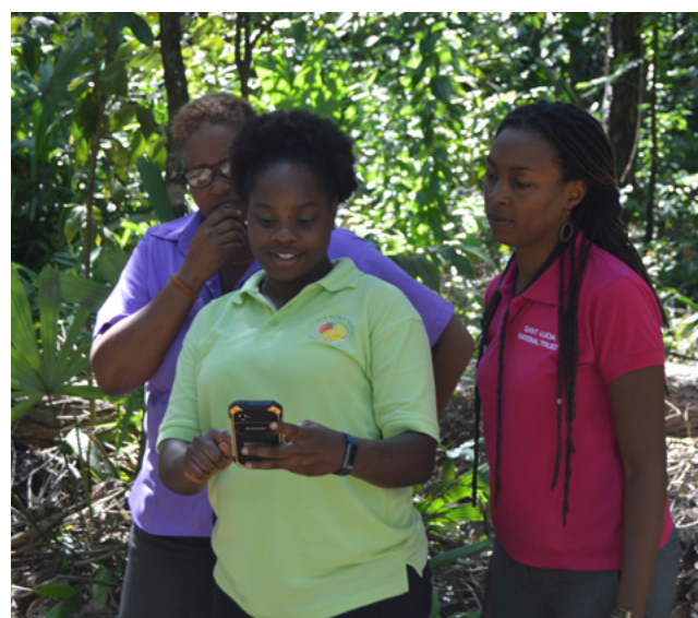
Photos (from top to bottom): Community rangers recording wildlife tracks, Mexico ; Emberá community rangers, Panama ; St. Lucia Forestry Department & St. Lucia National Trust staff during a SMART training exercise