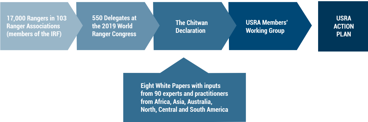
FIGURE 1. Overview of the process for developing the URSA action plan

Based on the Chitwan Declaration, the findings of the White Papers and the experience and programmes of its member organisations, URSA members worked together during 2020 to develop the action plan presented here, with the support of an independent facilitator and plan compiler (see Figure 1). Due to the constraints imposed by the COVID-19 pandemic, this process was conducted entirely online, through virtual meetings, workshops and reviews of several drafts.