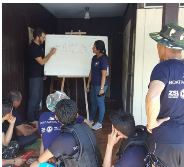
Photos (from top to bottom): Medical training course © Panthera; Ranger with family, Bhutan © Rohit Singh / WWF; Panthera leads a marine boat board & search training, Thailand © Panthera