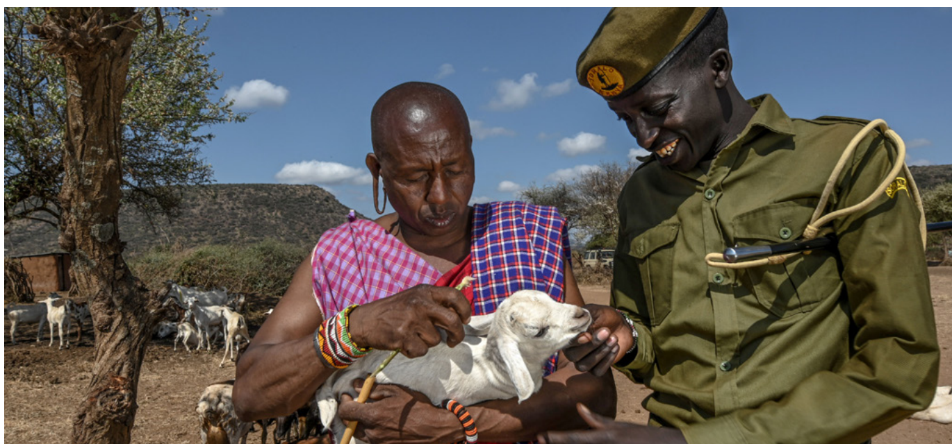
Conservancy ranger meets with villagers who have lost livestock to wildlife in Kenya