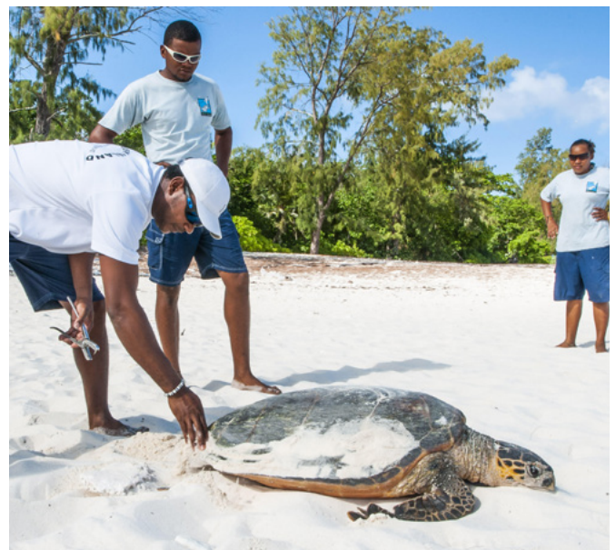
Rangers in the Seychelles on Cousin Island monitoring Hawksbill turtles