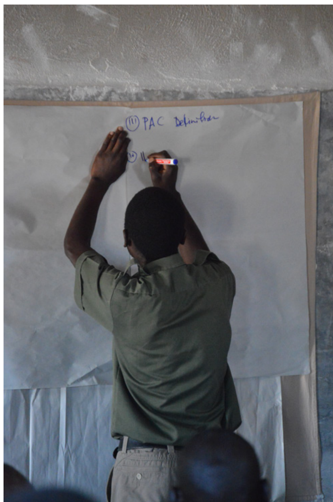
Ranger-led community workshop, Zimbabwe