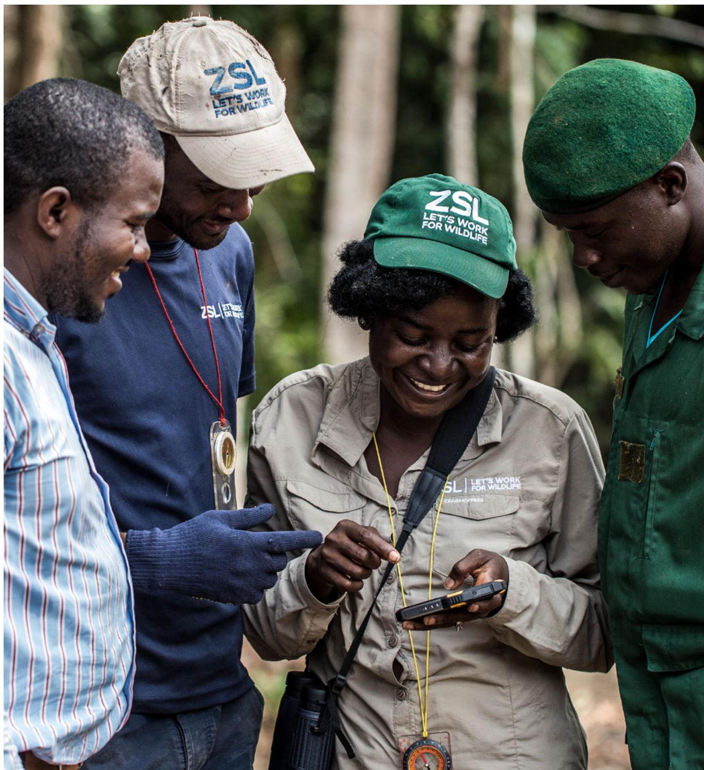
Dja Guard Training, Cameroon

Cover photos (clockwise from top left): Dawn inspection during early morning drills ; Senior forestry officer on patrol, Royal Manas National Park, Bhutan ; Indigenous Tamaraw Conservation ranger ; Communications protocol ; WWF-Kenya trains conservancy rangers